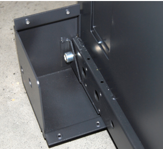
Step 2: Use plinth as a template to mark out the holes to drill. Bolt plinth to the ground.